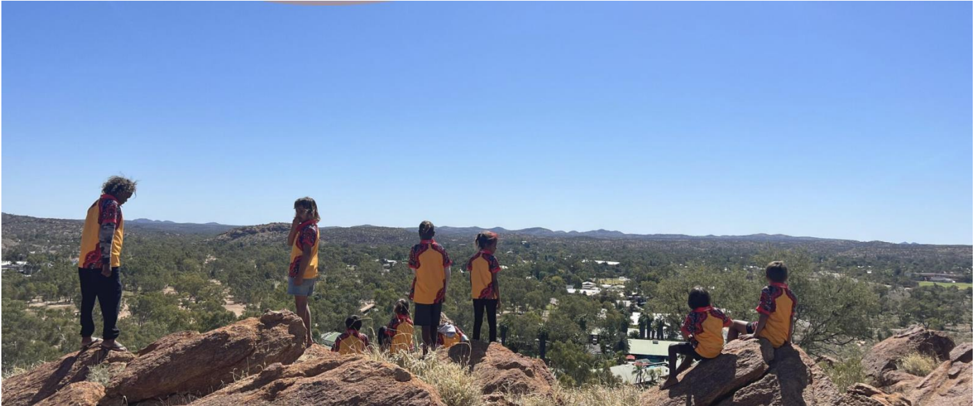
Yipirinya school photo.

Final brief on the Yipirinya School visit. Lets make them welcome.